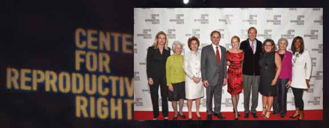
Members of the Center's Board