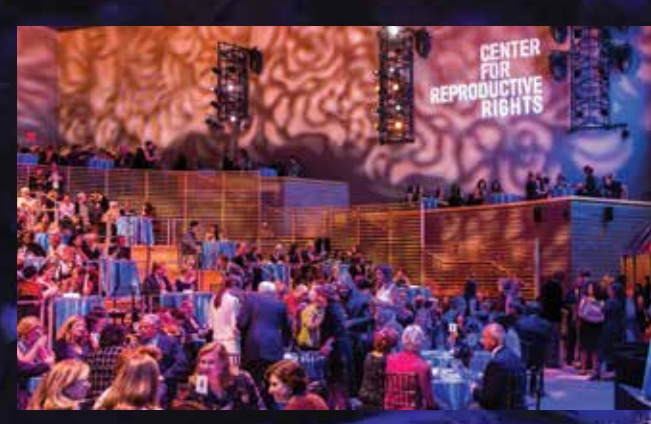
Guests waiting for the program to begin