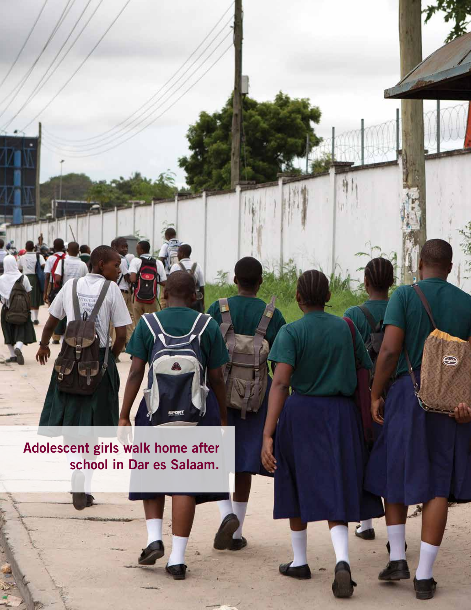
Adolescent girls walk home after school in Dar es Salaam.

In addition, the most common testing method used by schools and health care providers seems to be a physically invasive manual procedure, which involves a teacher or health care provider pinching, squeezing, and kneading a female student's abdomen and sometimes her breasts to determine pregnancy. Many interviewees described this procedure as painful. They also reported that they were not given the option to choose between this manual procedure and a urine pregnancy test. Pinching or squeezing an adolescent girl's breasts to determine pregnancy is not an accepted medical practice; further, manual testing in any form is not an effective screening procedure for pregnancy prior to the second trimester. Nonetheless, it is preferred by schools because, unlike a urine pregnancy test, it can be performed free of charge. The use of this method for purely financial reasons reflects the punitive and disciplinary nature of forced testing.